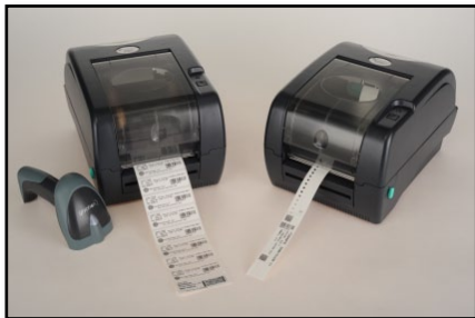
Label Station & Wristband Station

Easy To Read ~ No more unreadable imprints on your patient documents. You get crisp, clear labels and wristbands with or without barcodes anytime and anywhere you want.