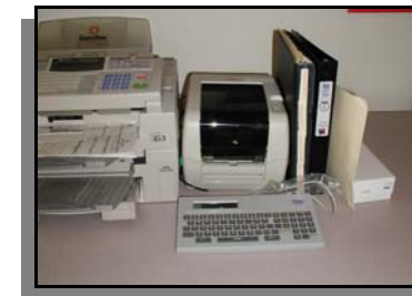
The Off-Line Data Capture Station is a small, self-contained system that fits anywhere in your department

When your Hospital System is down.. Patient ID Xpress™ keeps working!