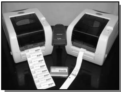
Label Station & Wristband Station

Easy To Afford ~ Are you tired of paying the high supply costs of your laser printed labels & wristbands? Looking to eliminate the maintenance costs of your old card based system? Patient ID Xpress™ is both affordable to purchase and operate.